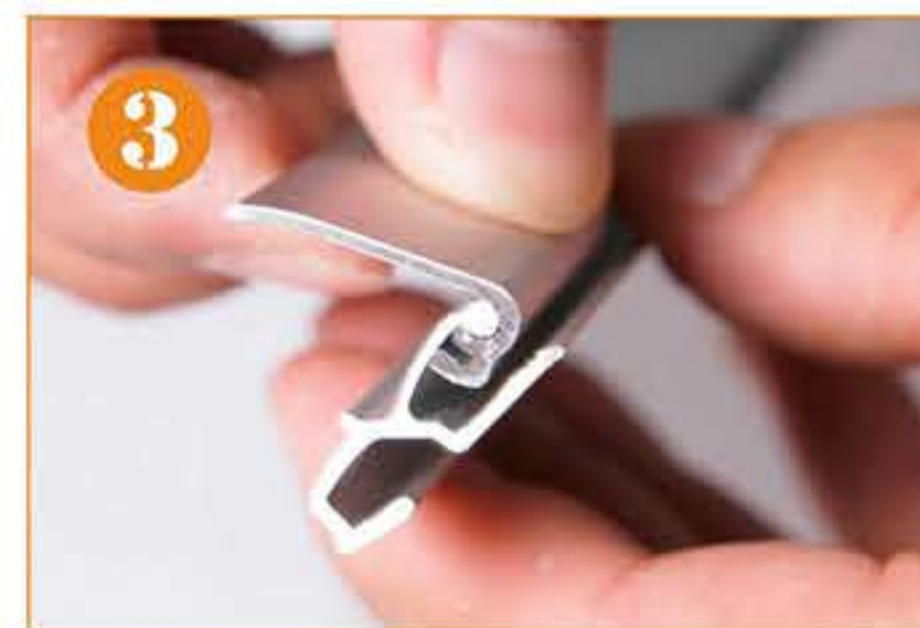
3. Open the top bar