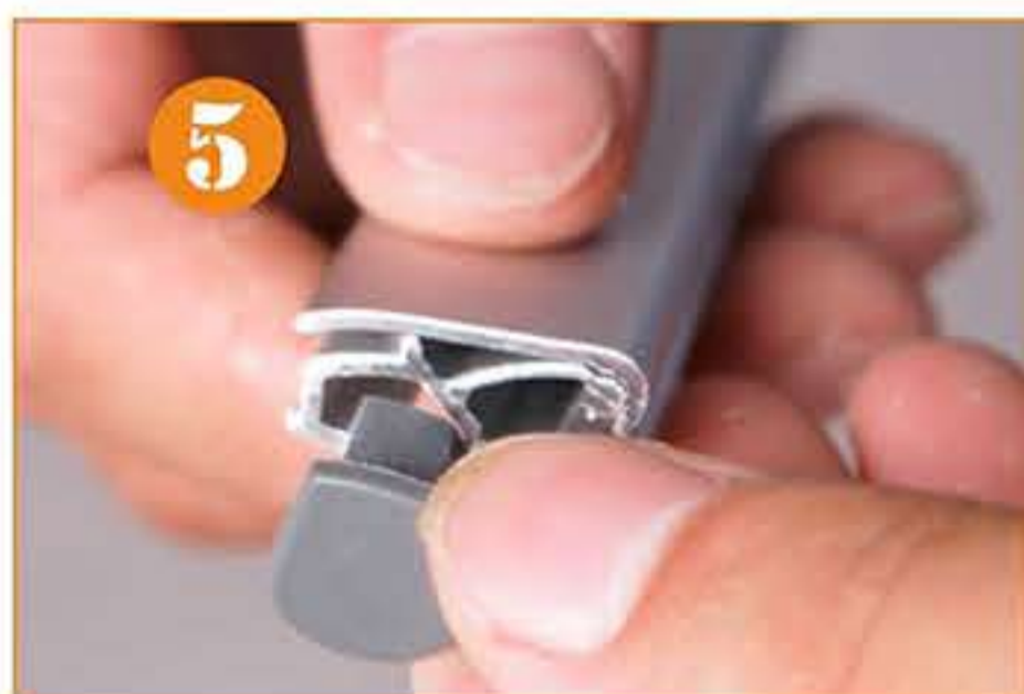
5. Close the end caps of top bar