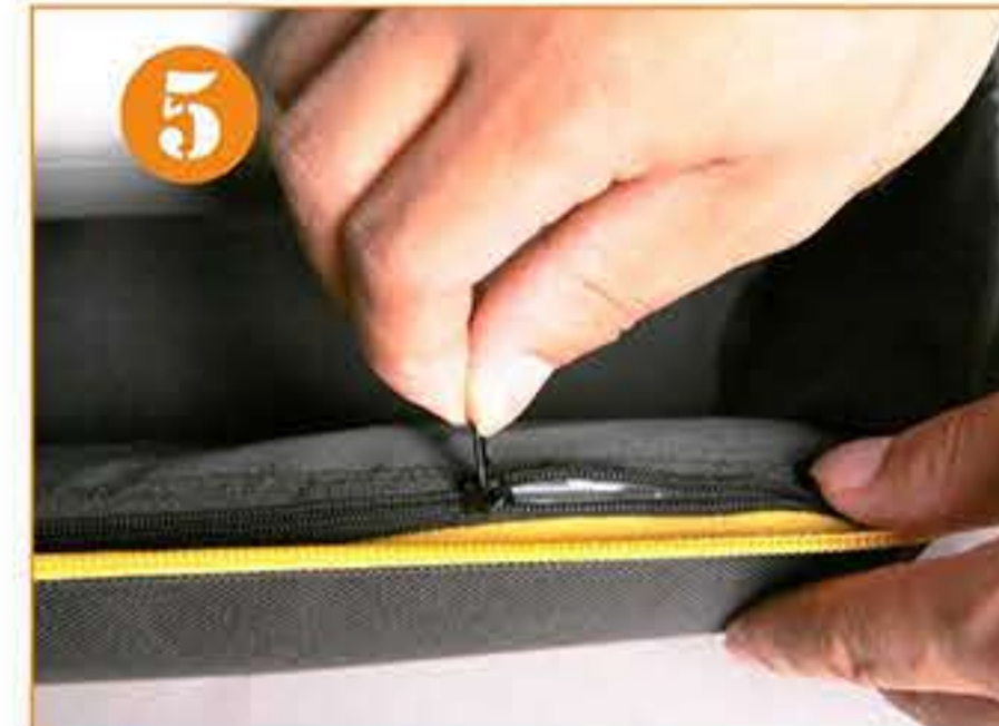
5. Take out the pole from pocket