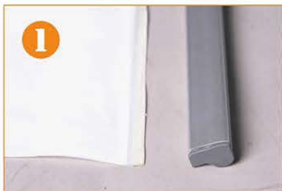
1. Put the graphic and top bar together like this