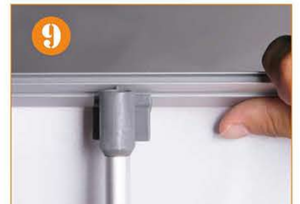
9. Fix the top bar