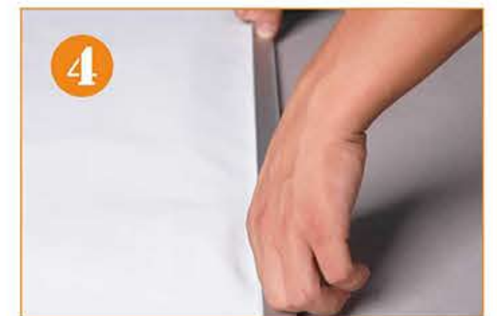
4. Insert the graphic and Press the top bar