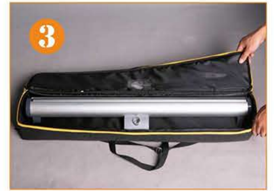
3. Take out the base from the bag