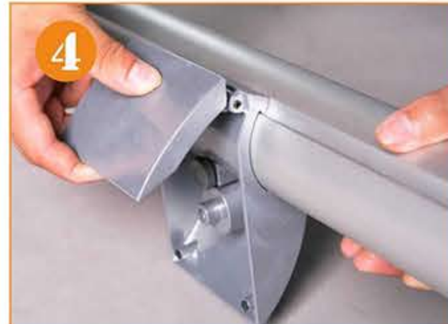
4. Open the feet and put the base on the ground