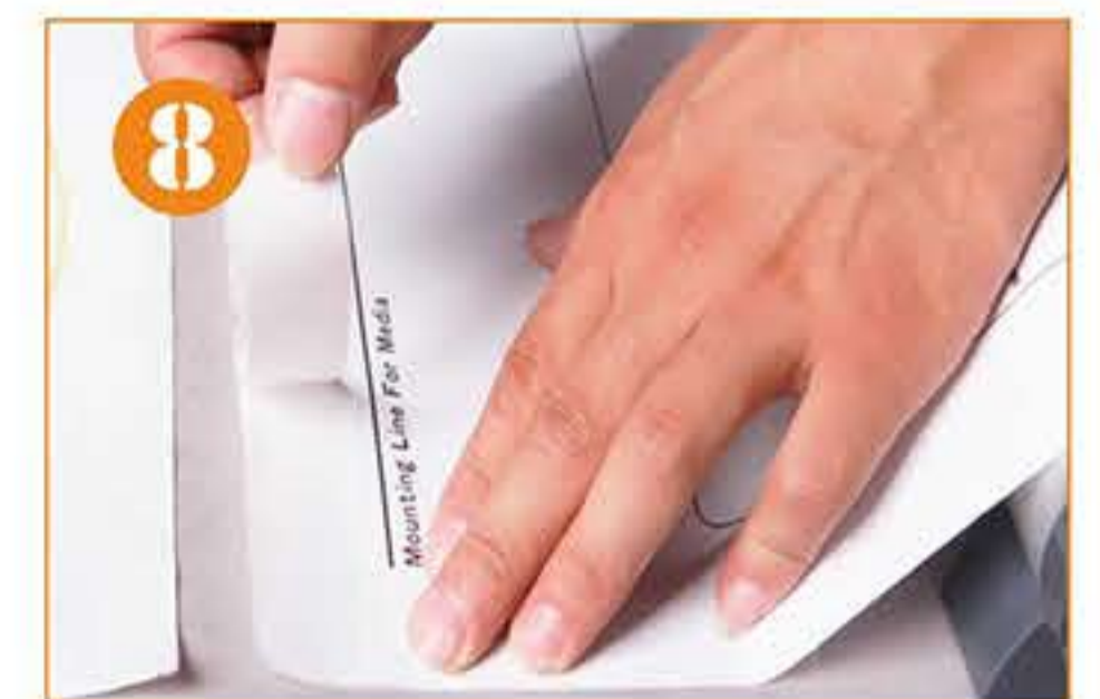
8. Remove the 3m glue