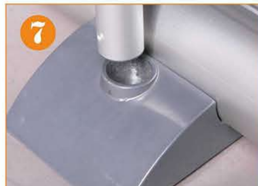
7. Insert the pole into base