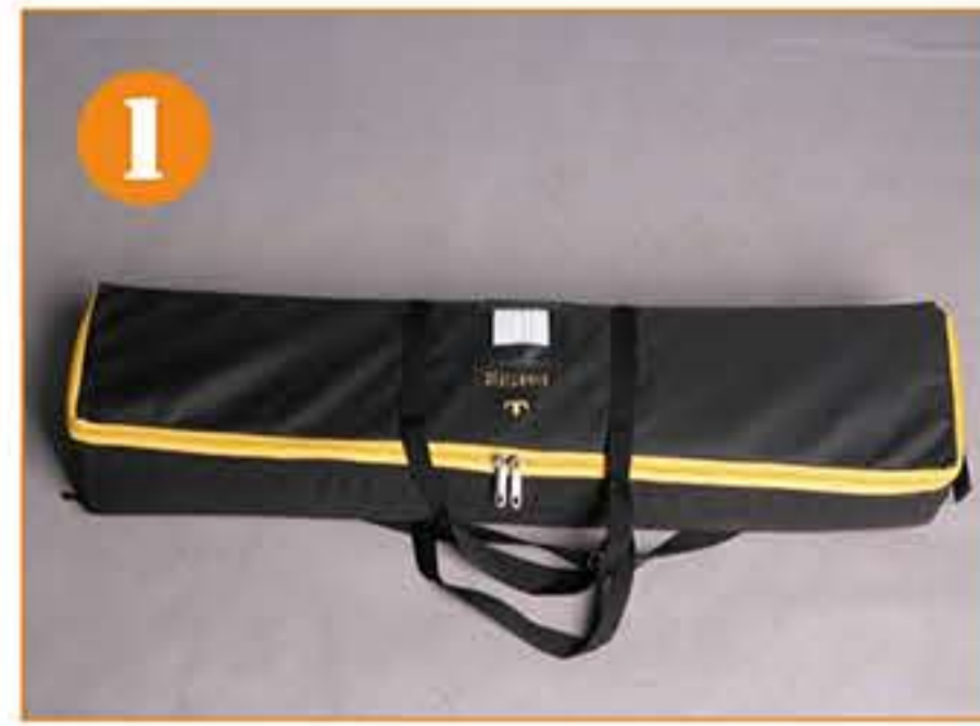
1. Bag with stand