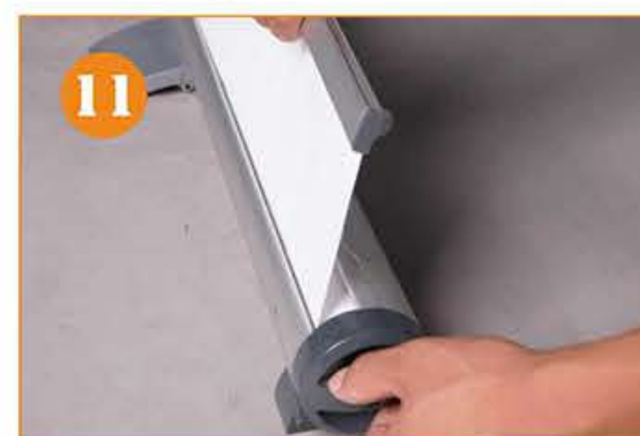
11. Add the tension and allow the graphic go into the base