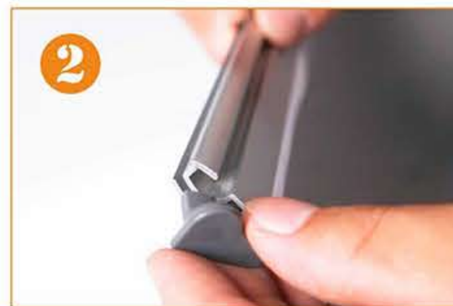
2. Remove the end caps of top bar