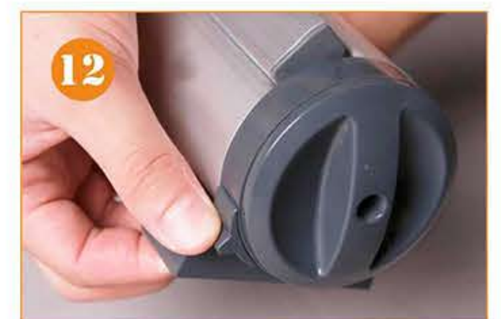
12. If you think the tension is too much or you want to change the new graphic, you can push the plastic down and release the tension