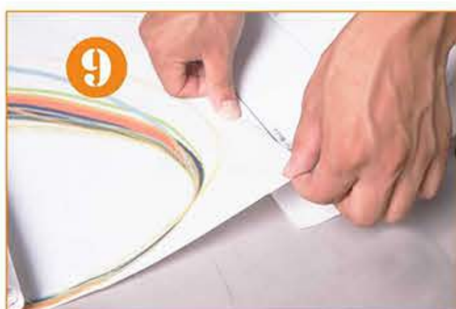
9. Stick the graphic