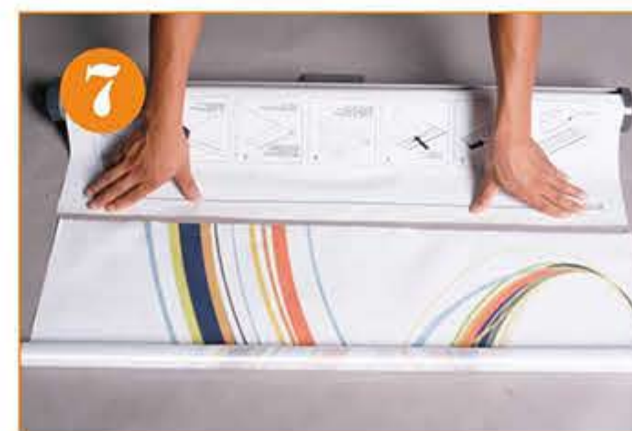
7. Put the graphic and base leader together like this