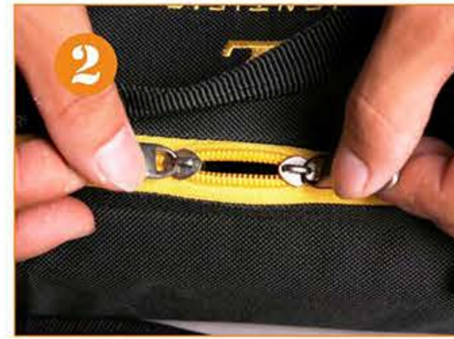
2. Open the bag