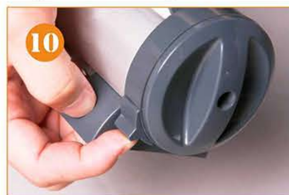
10. Push the plastic up and lock the cartridge