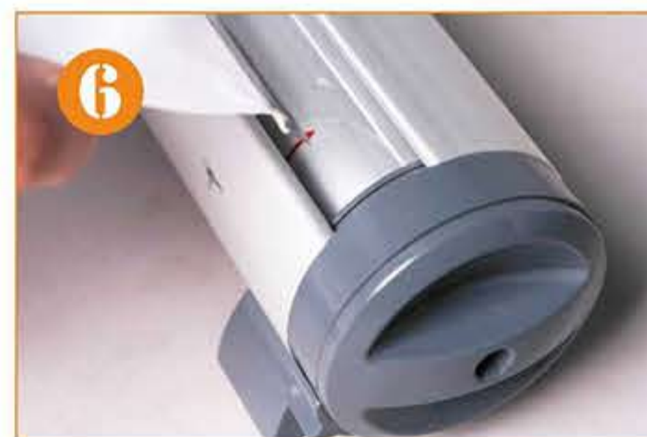
6. Insert the leader into the magnetic cartridge