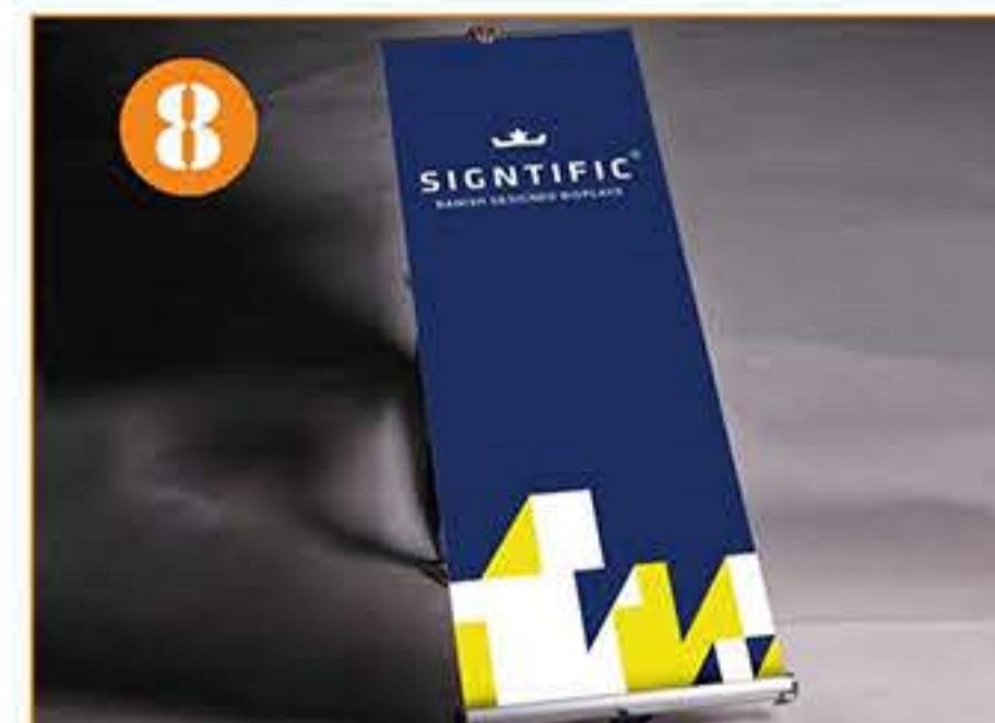
8. Tilt the unit toward yourself while raising the graphic to the top of the pole