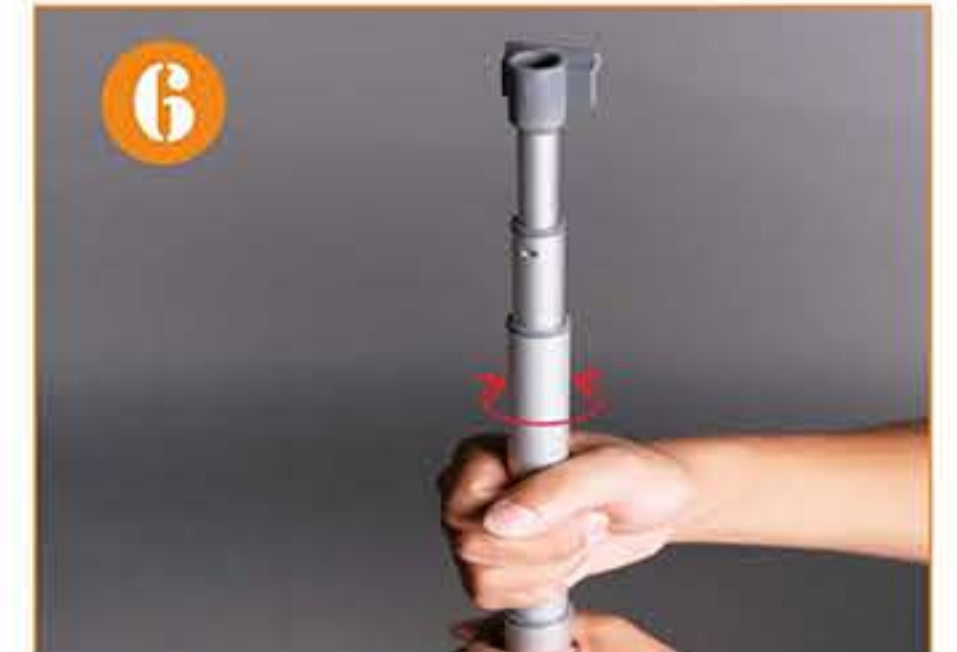
6. Wring and fix the pole